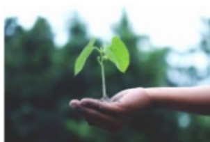
Factsheet: Atheism December 21, 2022