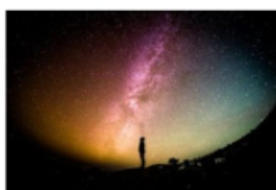
Factsheet: Humanism December 21, 2022