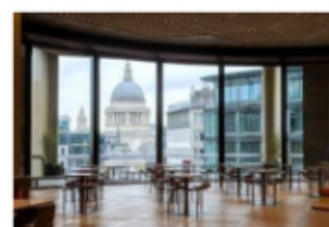
Faith-friendly policies improve workplaces, companies tell No 10 July 11, 2023

An independent and impartial body designed to support journalists cover religion and belief across the world but is also a great resource for teachers and anyone interested in religion and worldviews. Check out the range of factsheets in the resources section.