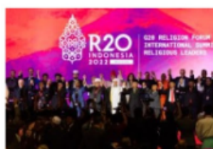
Explainer: R20 - Global religion at the G20 November 2, 2022