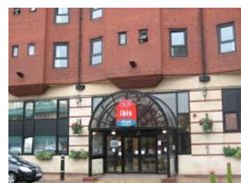
Ibis Hotel Birmingham Centre 21 Ladywell Walk, Arcadian Centre, Birmingham B5 4ST (5 minute walk from New Street Station)